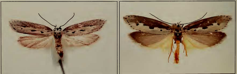
Fig. 1. Ethmia mariannae sp. n. Paratype (ZMUC). Fig. 2. Ethmia iranella Zerny, 1940 (HNHM).

Male genitalia (Figs. 4, 4a). Uncus bifid, apically pointed, with deep, narrow medial incision. Posterior part of gnathos well developed, dentate, anterior part slightly bilobate, finely dentate. Labis wide-based, triangular; anellus sclerotised. Valva with bristles; costa broad, with rounded apical part. Cucullus broad, curved ventrad, rather hooked; covered with scattered, fine bristles. Sacculus large, rather triangular,